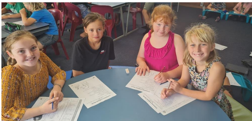
We have been enjoying reading and literacy activities