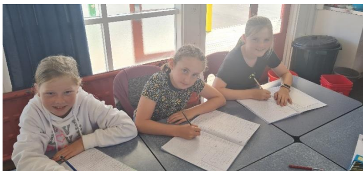
We are really loving maths