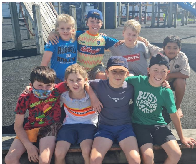
We love hanging out with our friends