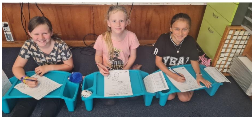
We like our new tables to work on